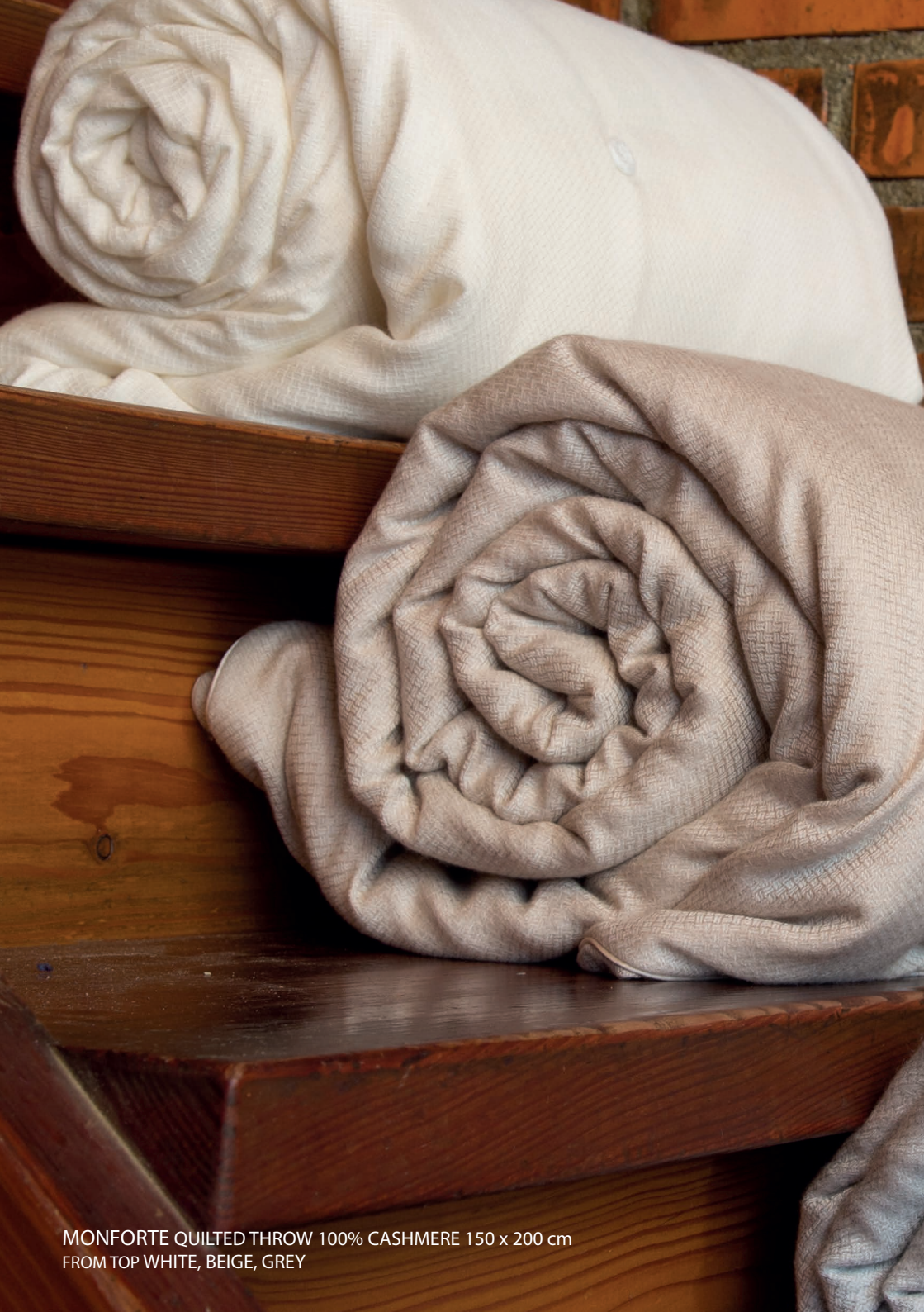
MONFORTE QUILTED THROW 100% CASHMERE 150 x 200 cm FROM TOP WHITE, BEIGE, GREY