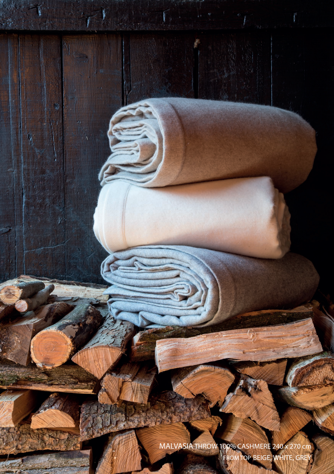
MALVASIA THROW 100% CASHMERE 240 x 270 cm FROM TOP BEIGE, WHITE, GREY