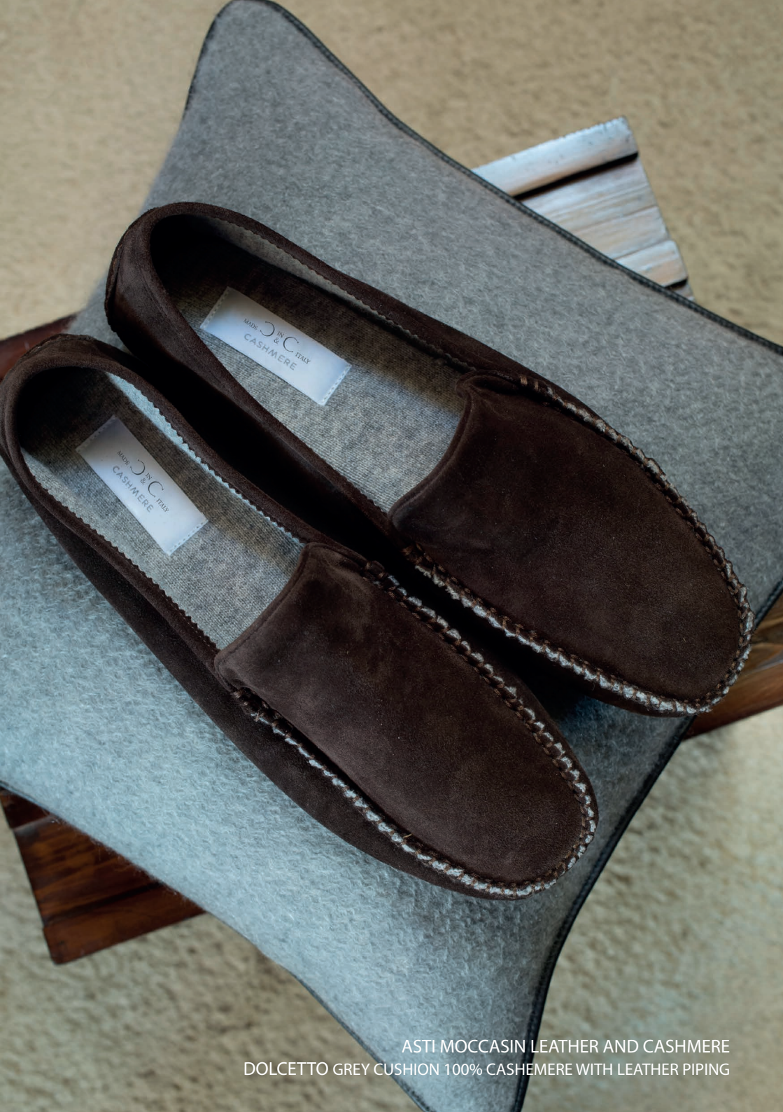
ASTI MOCCASIN LEATHER AND CASHMERE DOLCETTO GREY CUSHION 100% CASHMERE WITH LEATHER PIPING