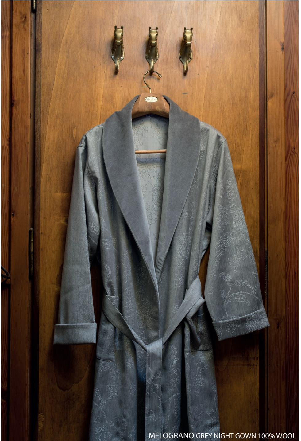
MELOGRANO GREY NIGHT GOWN 100% WOOL