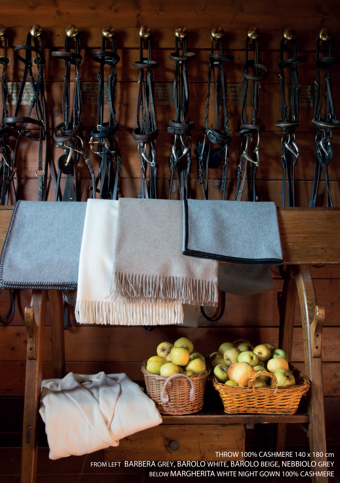
THROW 100% CASHMERE 140 x 180 cm FROM LEFT BARBERA GREY, BAROLO WHITE, BAROLO BEIGE, NEBBIOLO GREY BELOW MARGHERITA WHITE NIGHT GOWN 100% CASHMERE