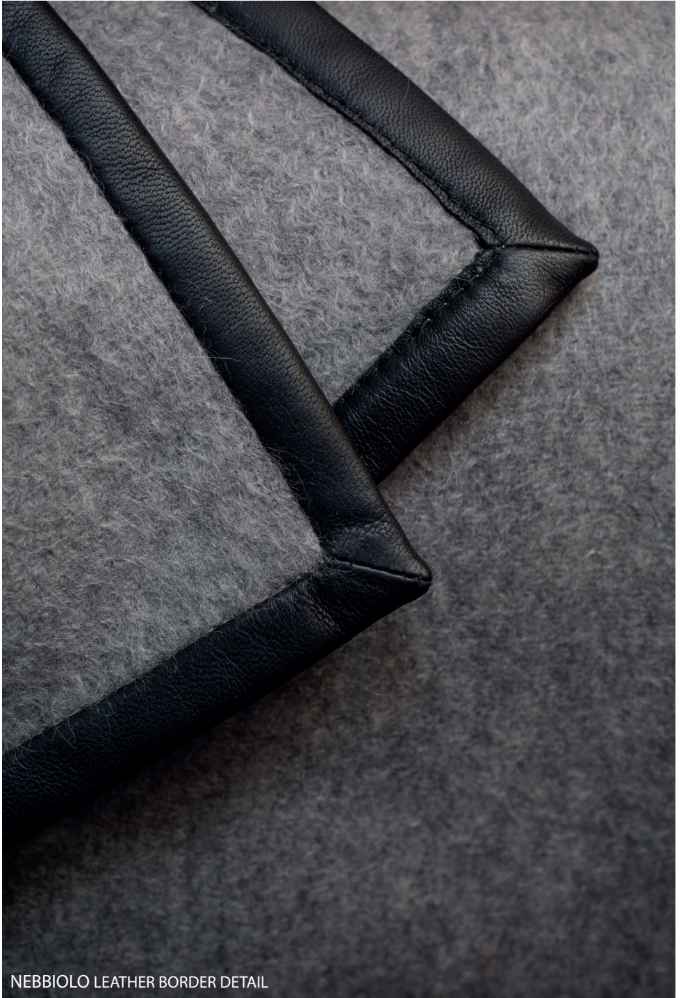
NEBBIOLO LEATHER BORDER DETAIL