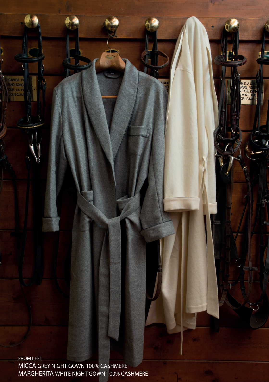
FROM LEFT MICCA GREY NIGHT GOWN 100% CASHMERE MARGHERITA WHITE NIGHT GOWN 100% CASHMERE