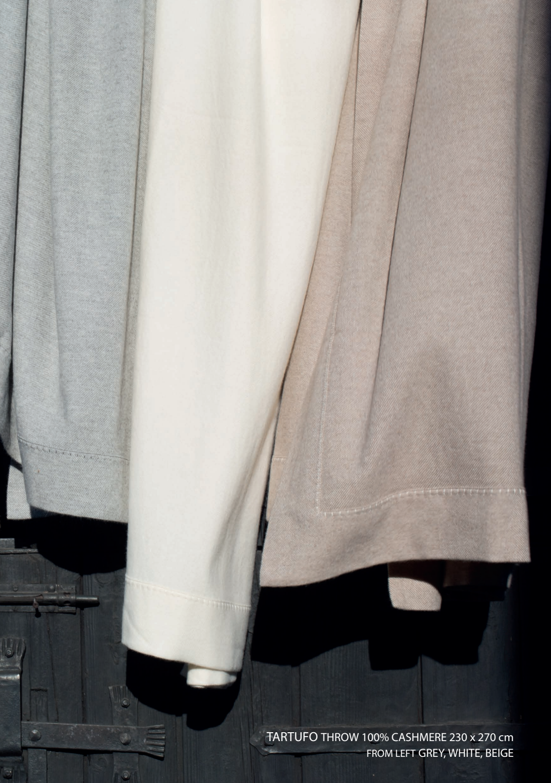
TARTUFO THROW 100% CASHMERE 230 x 270 cm FROM LEFT GREY, WHITE, BEIGE