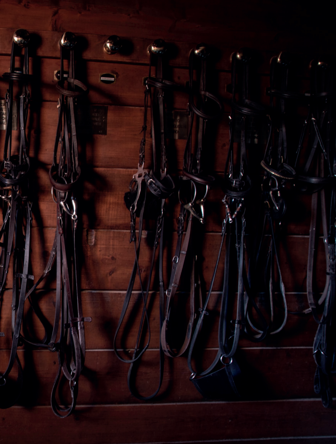
MARGHERITA WHITE NIGHT GOWN 100% CASHMERE