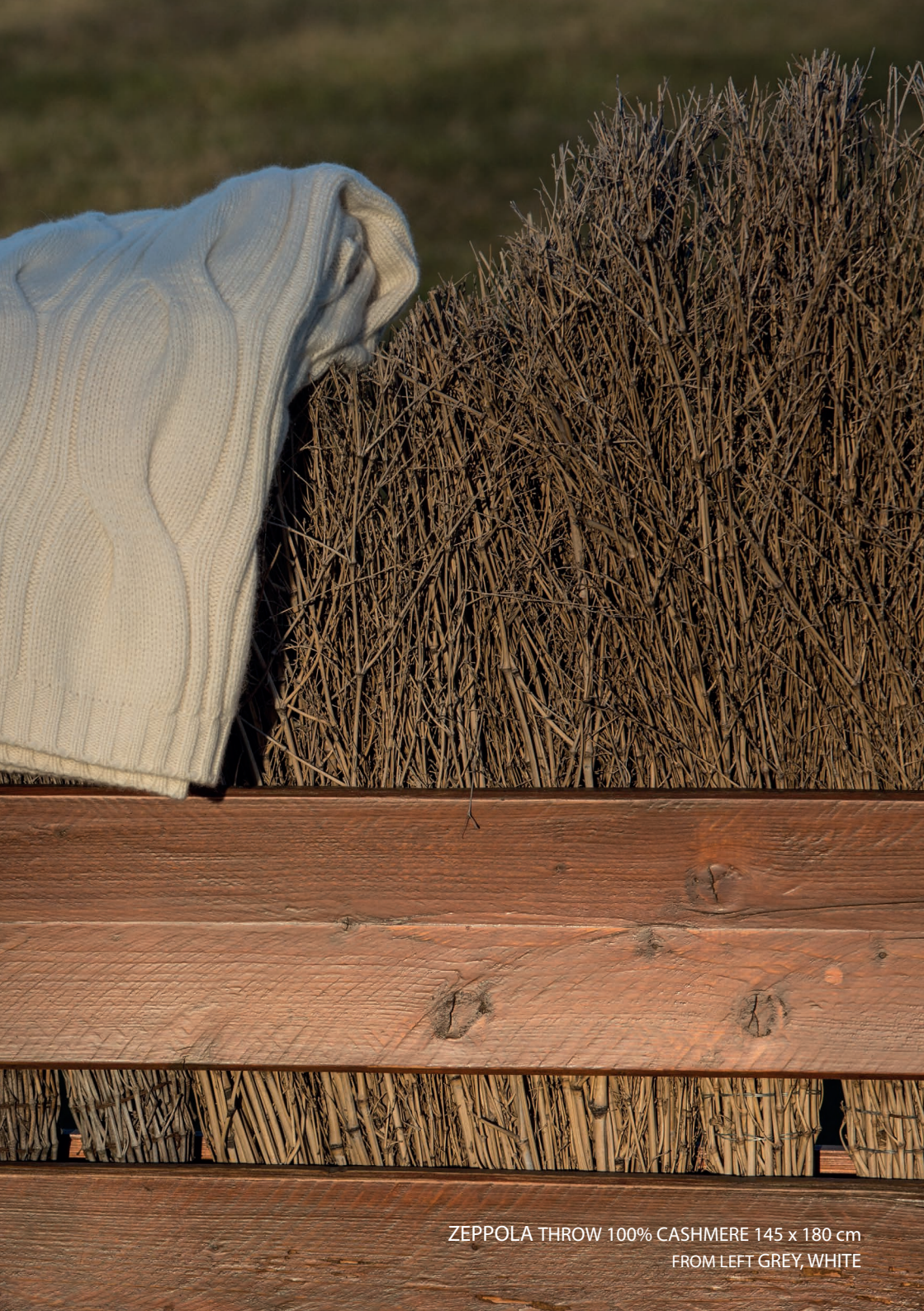
ZEPPOLA THROW 100% CASHMERE 145 x 180 cm FROM LEFT GREY, WHITE