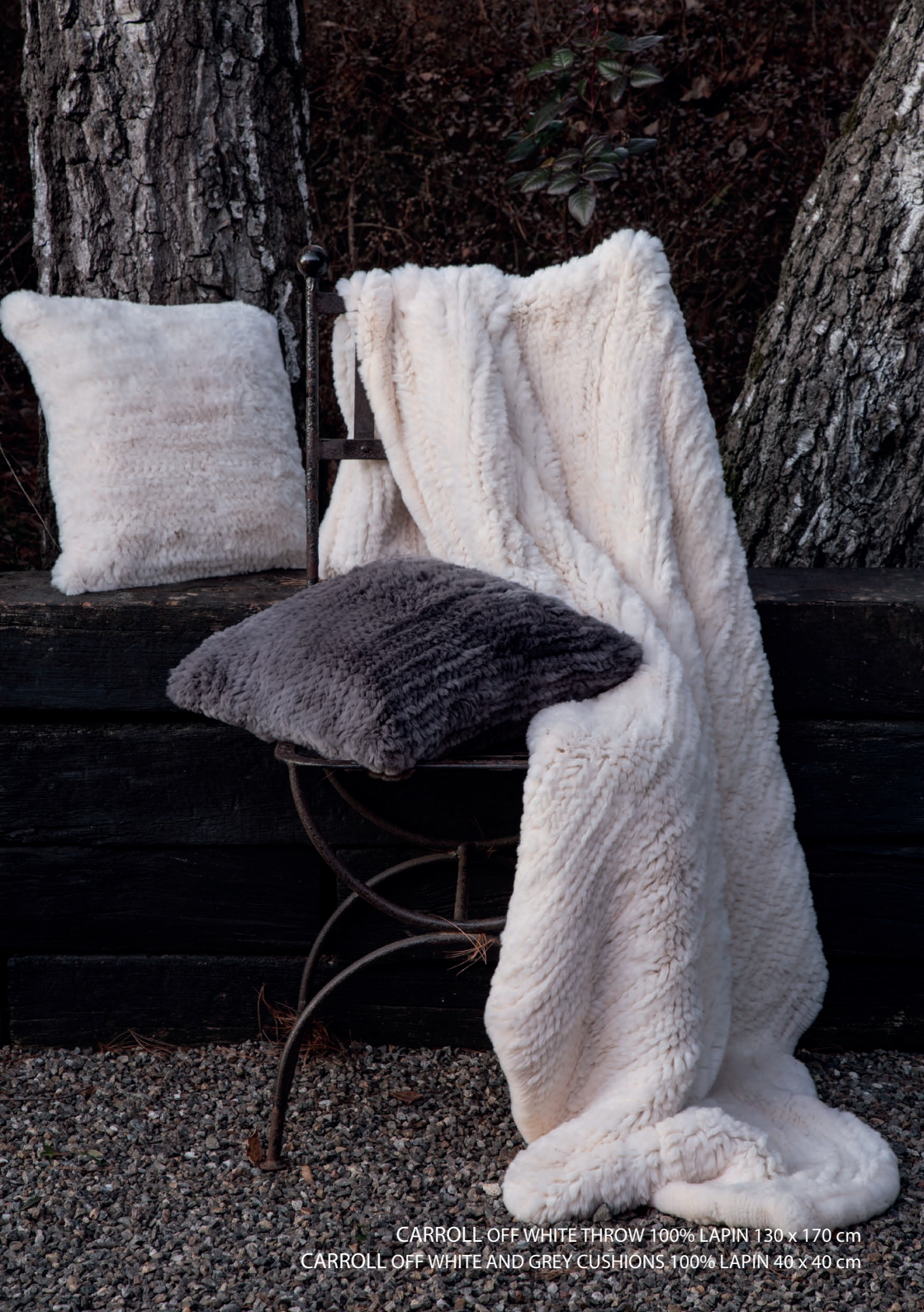
CARROLL OFF WHITE THROW 100% LAPIN 130 x 170 cm CARROLL OFF WHITE AND GREY CUSHIONS 100% LAPIN 40 x 40 cm